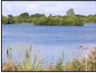
Lake 104: planned to be developed into a new tourist centre

Environmental campaigners in Fairford have been campaigning to save a lake in the Cotswolds. Planning applications have been put in to turn the site into a new tourist centre, which will destroy the lake and the natural environment around it. Read more here.